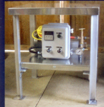
System in Open Stand