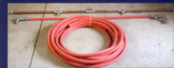
Custom Spray Bar & Housing