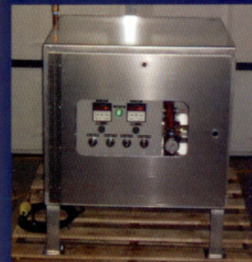
Enclosed Stand with See-Thru Door